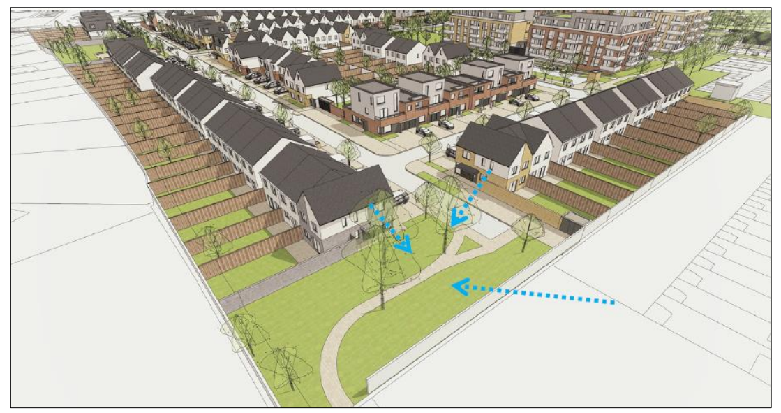
Figure 4.1: Passive Surveillance of Wickham Park

4.32 The report of KCC notes that the location of the open spaces is generally acceptable. The report of the Parks Section raises issues regarding passive surveillance of the pocket park adjacent to Magee Terrace. In response, the units have been orientated towards Wickham Park as illustrated in Figure 4.1 to provide passive surveillance.